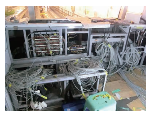
Fig. 3 Vehicle interior during modification work