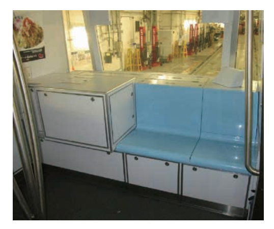
Fig. 4 Vehicle interior after finish modification work

In extension work, like the work we completed in Hong Kong International Airport, all work that might affect service operation on the existing lines are performed during nonoperational hours. In Hong Kong International Airport, because of daily maintenance work after service operation and confirmation run before the beginning of service operation in the next day, we had no more than about 3 hours a night to do