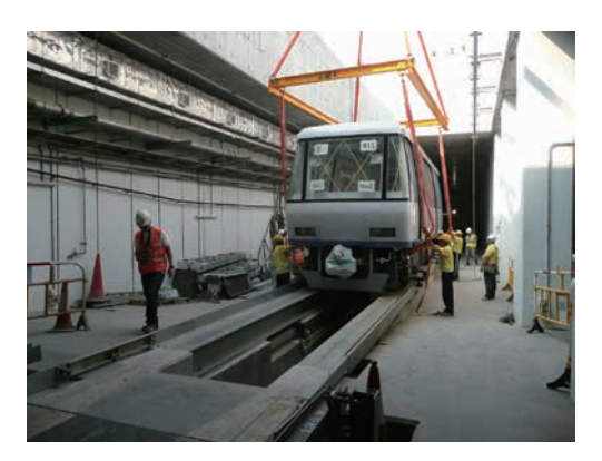
Fig. 5 Delivery of a new vehicle

For the extension of the existing lines, we took a special measure called Separate Track Test, in which a running test was conducted only on the extensions. This measure divided each track into three areas: an operating area, a test area, and an isolation area located between the operating and test areas to prevent the vehicle running in the operating area from entering the test area and vice versa. Track end buffers that had been installed since before the track extension work at the end of operation area were left unremoved, and the traction power feeder line in the isolation area was deenergized. At the end of test area, temporary track end was also added to the track database of the new signaling system. In addition, additional temporary stations (stop positions)