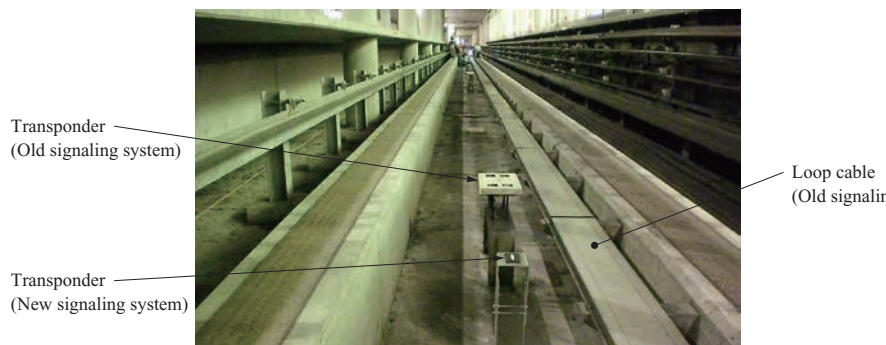
Fig. 2 Trackside equipment for new and old signaling systems

During the vehicle modification work, we had to deal with the lack of space for installing devices and cables. Due to their intrinsically compact design, the vehicles lacked empty spaces. Also we had to leave the old signaling system as it was. Therefore when installing new on-board controllers on the old vehicles, we removed some of the seats and then installed their housings. In order to install additional cables that could not be installed in the existing underfloor cable duct, we installed additional cable duct in the ceilings. Because of these cables, terminal blocks also had to be added, and they were located taking ease of future maintenance into account to the maximum extent possible. Figure 3 provides a photograph of the vehicle modification