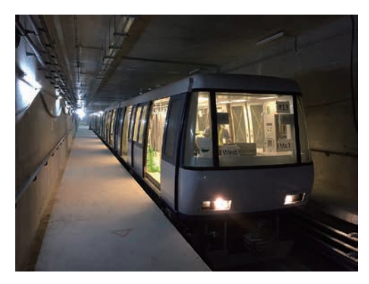
Fig. 6 Test runs