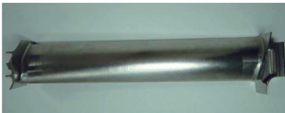
Titanium aluminide turbine blade