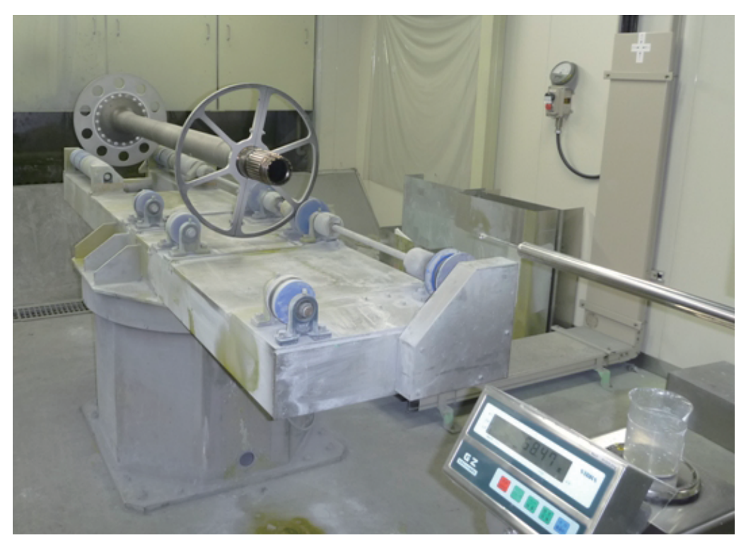
Automated engine shaft coating system

Mechanical Technology Department, Electrical System Department, Products Development Center, Corporate Research & Development, IHI Corporation