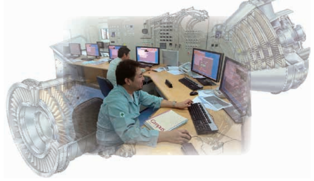
CSI-III+ monitoring system

The CSI gas turbine control system has been making integrated control of cogeneration plants possible for 26 years. We have been actively working to improve the operation monitoring and make remote monitoring of preventive maintenance possible.