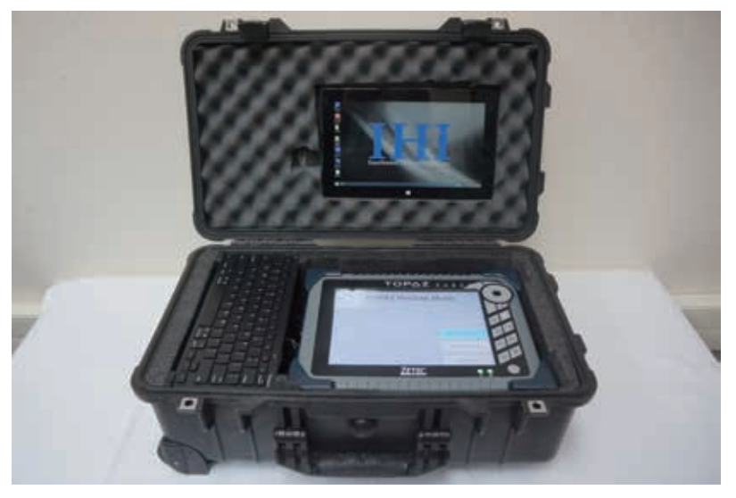
A Package of PASS valve inspection and diagnostic system

Predictive maintenance technologies are essential for efficient and safe plant operation. PASS valve inspection and diagnosis system has been applied as a new inspection method, where advanced ultrasonic techniques powerfully supports predictive maintenance planning.