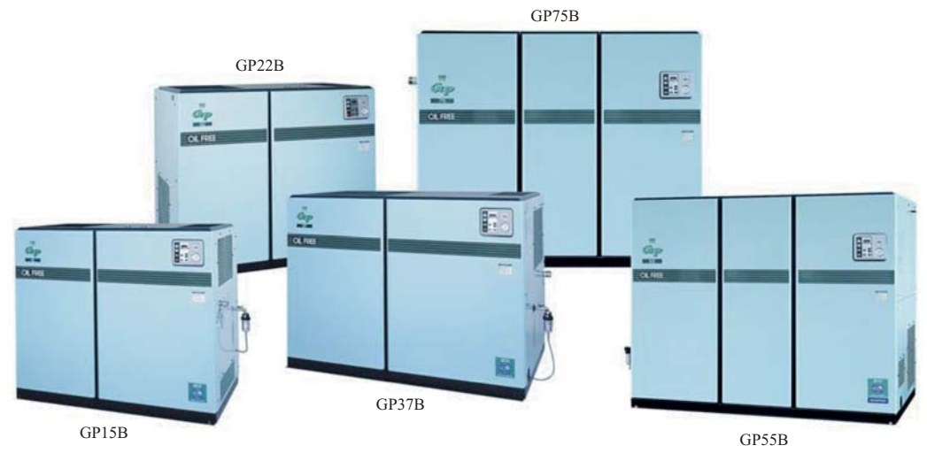
Fig. 1 Water-flooded oil-free screw compressor GP series

The GP series uses water for cooling and lubricating the air end and does not use oil at all. For this reason, it is free from oil mist, oil odor,