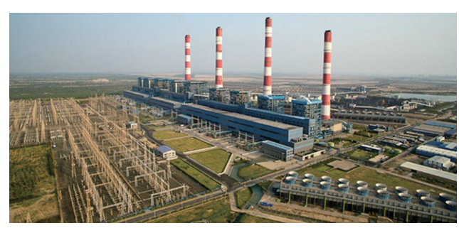
Mundra Thermal Power Plant, Adani Power Ltd.

the Mundra Thermal Power Plant, owned by Adani Power Ltd. in India. The Mundra Thermal Power Plant is equipped with an opposed firing boiler introduced by Babcock & Wilcox Beijing Co., Ltd. (China). Opposed firing is a type of combustion that features burners facing each other at the front and back of the furnace. IHI has a long history of designing and remodeling opposed firing boilers. Using the