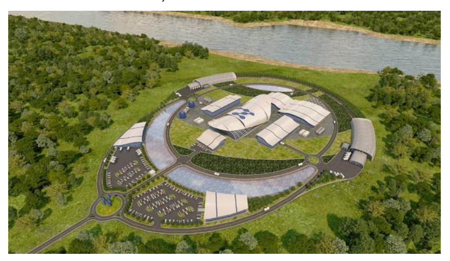
Envisaged facility when completed