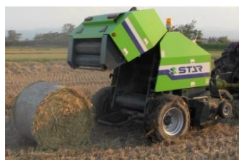
TRB/TCR2240 series (Dia.100cm x Wid.100cm)

Best match for the bale made by big round baler (Dia. 120cm x Wid.122cm). In addition, middle size bale made by TRB/TCR2240 series (Dia.100cm x Wid.100cm) can be wrapped by attaching special parts equipped as standard. Both middle and big round bale can be covered by one wrapping machine.