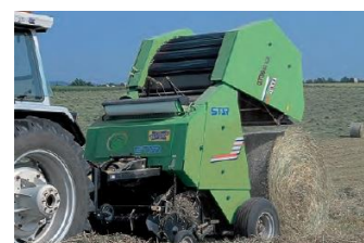
Big Round baler series (Max.Dia.130cm x Wid.130cm)