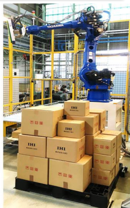
Mixed load pallet