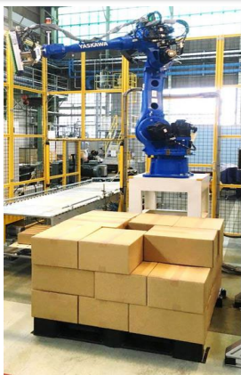
Single load Pallet