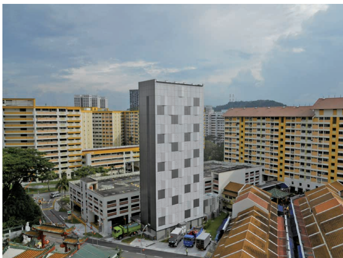
A Tower Parking System (Pallet type) constructed for the Housing and Development Board of Singapore

This article introduces the Tower Parking Systems (Pallet type) of IHI Transport Machinery Co., Ltd. delivered to the Housing and Development Board of Singapore.