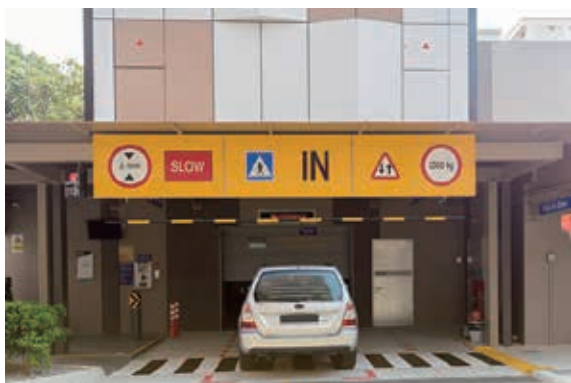
Entrance of the Tower Parking Systems (Pallet type) for Yishun District

Wider pallets of requirement ③ could not be simply made