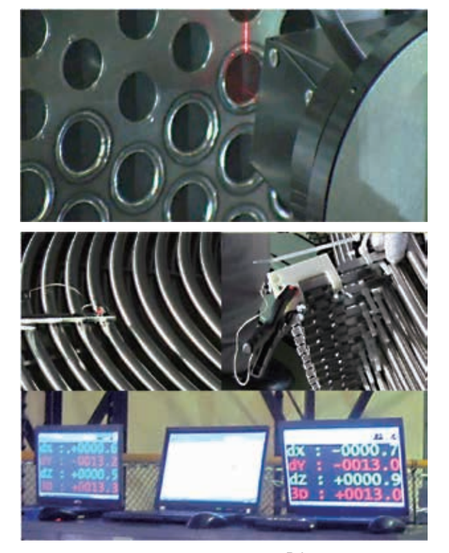
3D laser measurement

Also, we took a proactive stance to resolve problems with made-to-order products which has a feature that makes standardization of manufacturing processes difficult. For the works to insert the heat transfer tubes into the tube support plates, for example, standardized work process good for workers and products is established by analyzing the work postures and work contents of workers. In a stage to finally confirm the appropriateness of the standardized work process, it was confirmed that general operators who have no experience inserting the heat transfer tubes can carry out the