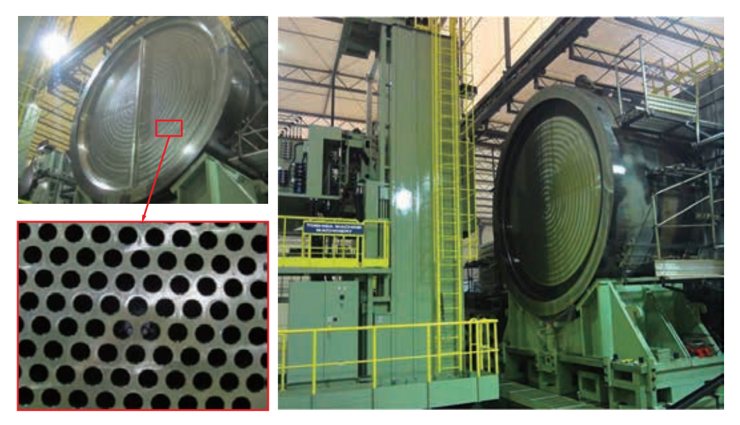
Deep hole-drilling machine for tube sheet BTA (Boring and Trepanning Association)

A thin wall thickness of the heat transfer tubes is advantageous in terms of high heat exchange efficiency due to low heat resistance. However, the heat transfer tubes also need to play the role of boundaries separating the primary system from the secondary system. Therefore, the required thickness is carefully designed taking into account the plant's operation. The heat transfer tubes also need to be carefully designed and delicately handled while an SG is manufactured because any possible damage to them might cause a serious accident such as contaminating the secondary system with the radioactive substances generated in the primary system.