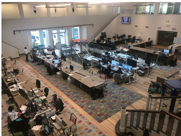
Partner venture capital firm (The co-working space in their building houses multiple startups)

Draper Nexus has deep connection with prestigious venture capital firms in Silicon Valley, and is operated by experienced capitalists, which allows us to access to right startups. In addition, they have strong ties with Japanese companies. Its proven track record of working with startups makes them an ideal partner for the IHI Group in starting open innovation activities in Silicon Valley.