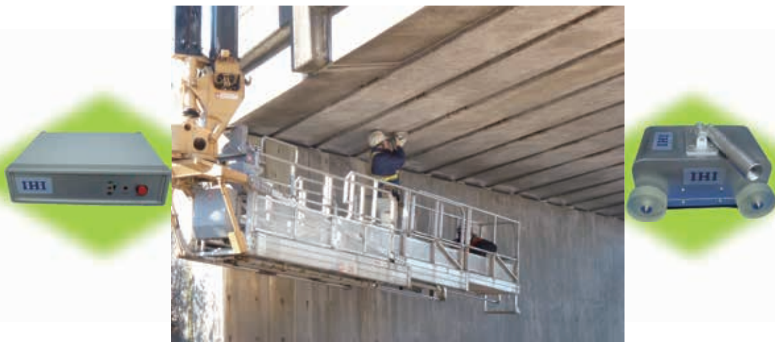
Measurement using “Concrete View”

Until now, in order to quantitatively measure the state of deterioration of concrete, the only method available was coring, in which internal samples were collected. IHI Infrastructure Systems Co., Ltd. has developed an innovative non-destructive diagnostic system for deterioration of concrete by applying the same spectroscopic analysis technology that is used to measure the sugar content of fruit.