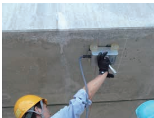
Photo of a probe head

The non-destructive diagnostic system for concrete we