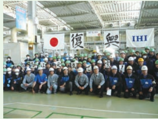
Group picture at the restored works

Logitec Co., Ltd. did everything they could to put it back into operation.