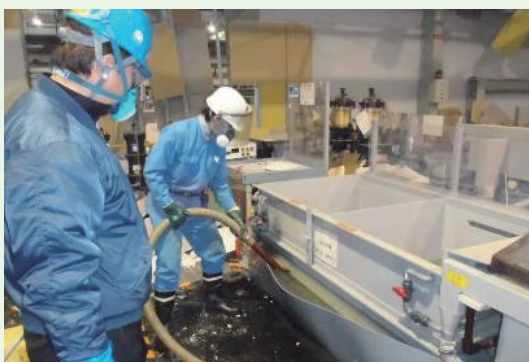
State of the surface treatment tank