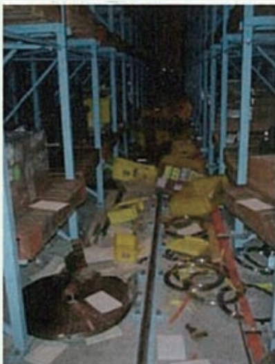
Warehouse racks (tools and fixtures have fallen)