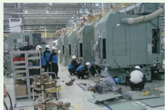
Adjustment of machinery