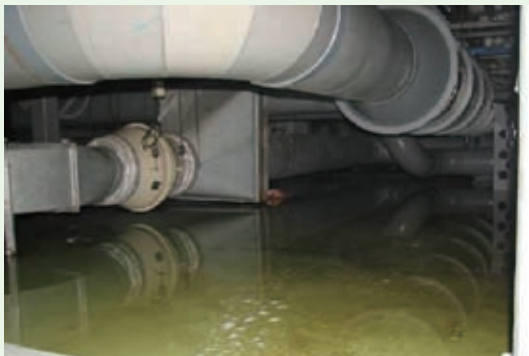
Acid solution bank in the surface treatment workshop

Some materials, tools, and fixtures in the automated warehouses fell and were damaged. A crane was rendered inoperable, but fortunately it was an IHI product and IHI