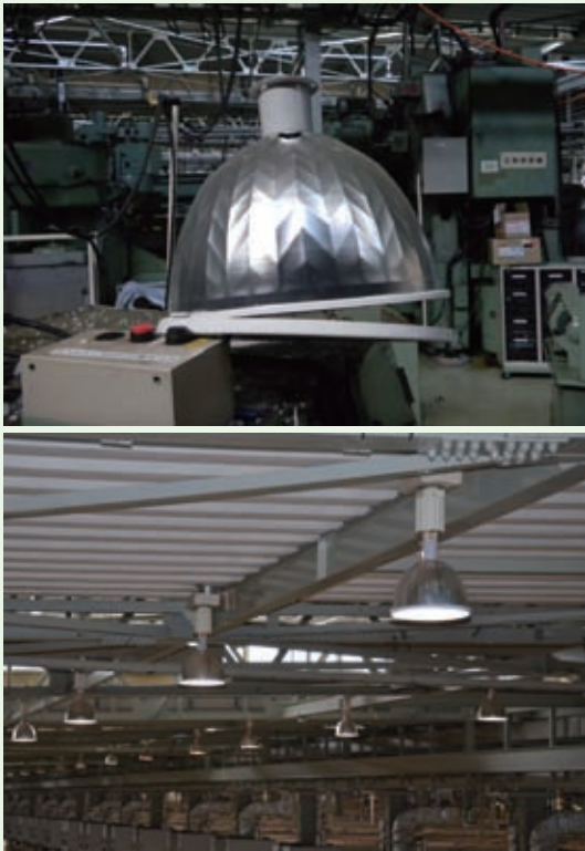
Ceiling light (top: after falling; bottom: after restoration)