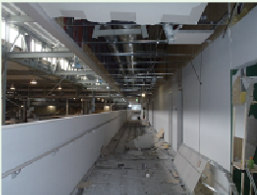
The ceiling collapsed in this connecting corridor